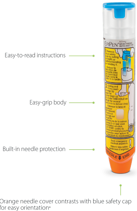
Orange needle cover contrasts with blue safety cap for easy orientation*